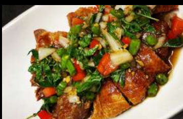
Basil Duck 🌶️

BBQ marinated pork served with sweet chili sauce and sautéed mixed vegetables.