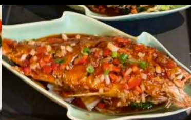
Whole Fish Red Snapper