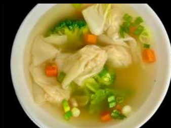
Shrimp Wonton Soup