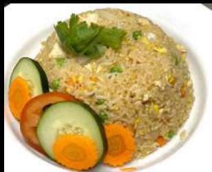
Thai Fried Rice