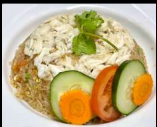
Crab Fried Rice