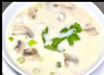
Tom Kha Soup