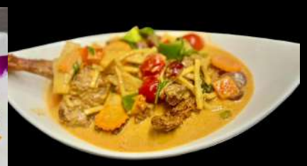
Red Curry Duck 🌶️