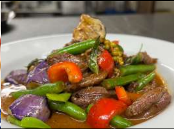
King Pad Phed