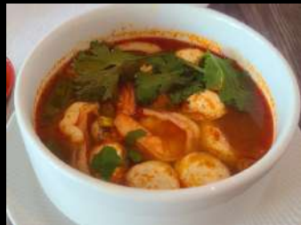
Tom Yum Soup